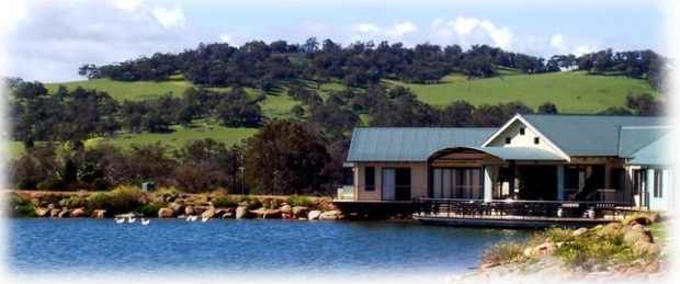
The function hall overlooks the lake