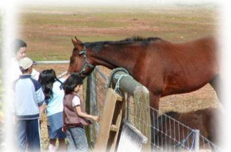
The kids will love to feed the animals