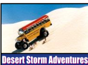
4WD Adventure & Sandboarding