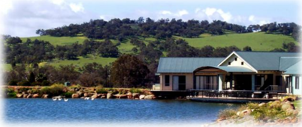
The function hall overlooks the lake