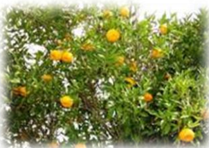
Pick fruit in season