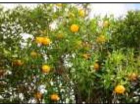
Pick fruit in season