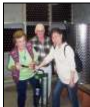
Visit our winery