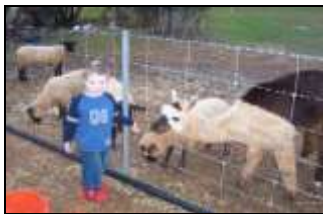
The kids will love to pet and feed the animals