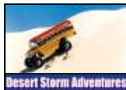
4WD Adventure & Sandboarding