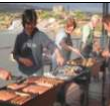
BBQs by the lake