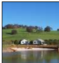
Relax and enjoy the fresh country air